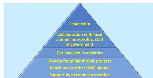
My vision of involvement in GMCGA at different levels

Wishing everyone the very best always. Regards